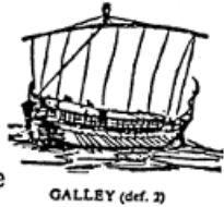
GALLEY (def. 2)